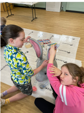
Painting the bunnies head