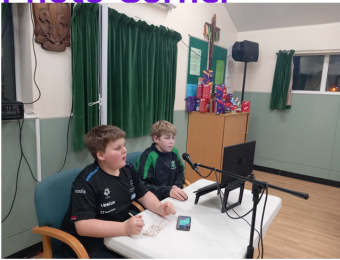
2 of our bingo callers