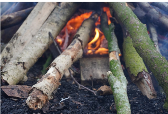
Just to help you feel warm.