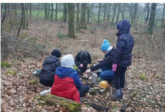
The scouts cooking.