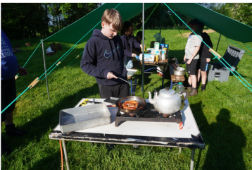
The scouts cooking.